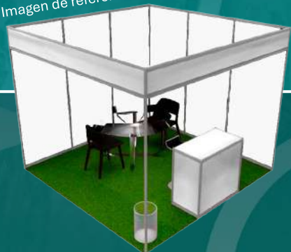
Imagen de referencia