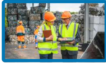
WASTE MANAGEMENT AND CIRCULAR ECONOMY